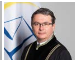
Judge Vladimir Mikula (Reserve Judge)