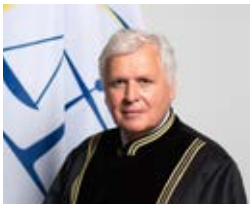
Judge Roland Dekkers