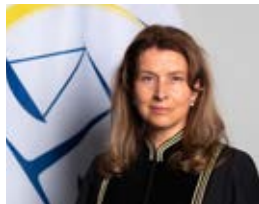
Judge Mappie Veldt-Fogla (Presiding Judge)