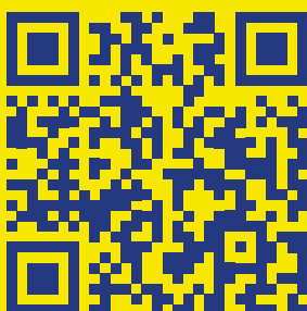
KSC X channel