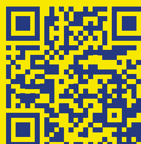
KSC Instagram channel