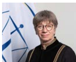
Judge Michèle Picard (Presiding Judge)