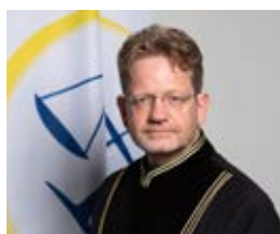
Judge Kai Ambos